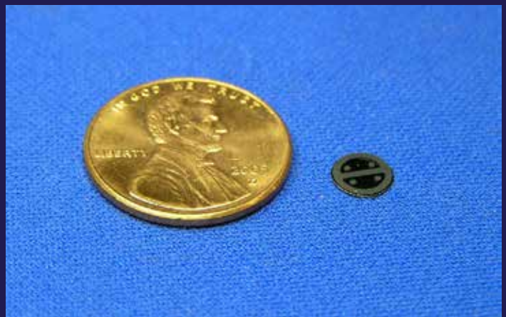
Turbine Engine Temperature / Pressure Sensor Suite