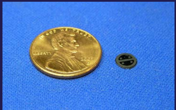
Turbine Temperature / Pressure Sensor Suite