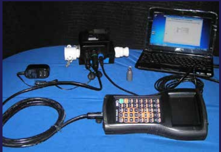
Inline Waterborne Pathogen Sensor System