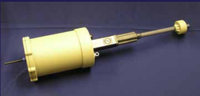
Wireless Pathogen Sensor Buoy