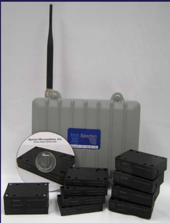
Wireless Asset Health Monitoring System