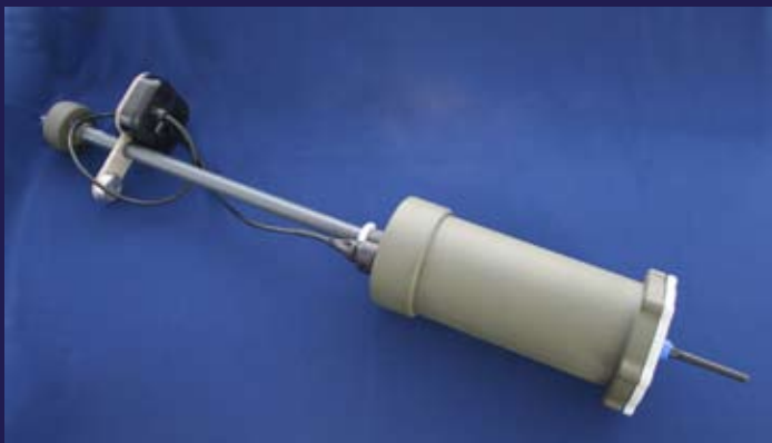
Waterborne Pathogen Sensor Buoy