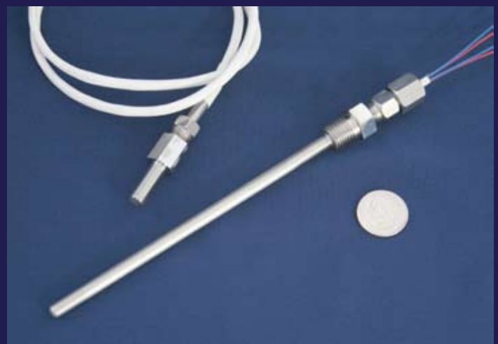
High Temperature Turbine Probes