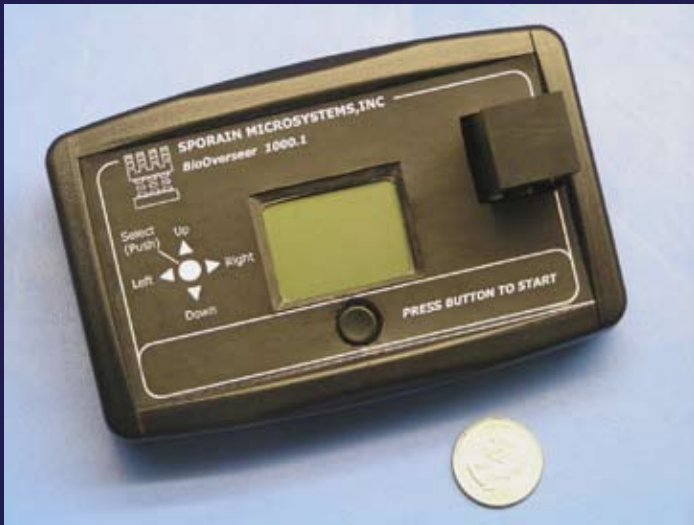
Hand-Held Bio Pathogen Sensor