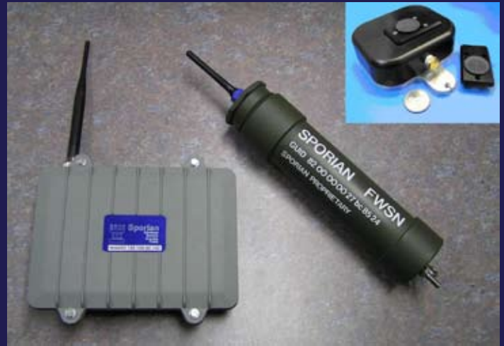
Waterborne Pathogen Sensor Buoy System