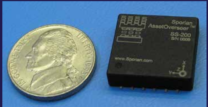
Ultra Low Power, High G, 3-Axis Accelerometer