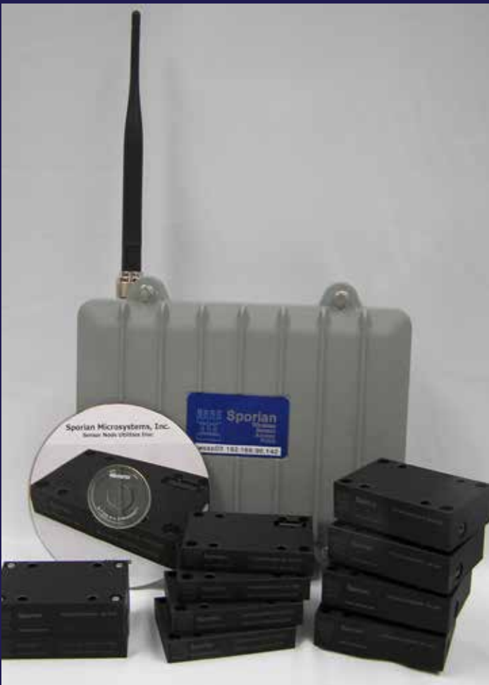
Wireless Asset Health Monitoring System